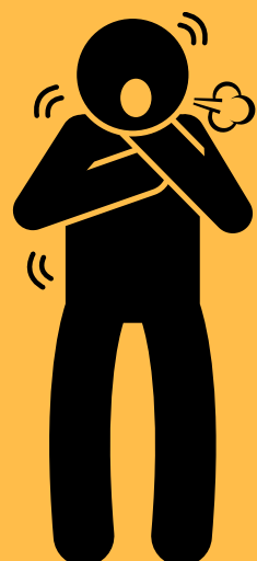
Short of Breath