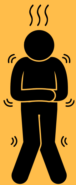
Fever or Chills