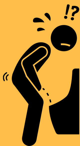
Little or No Urine