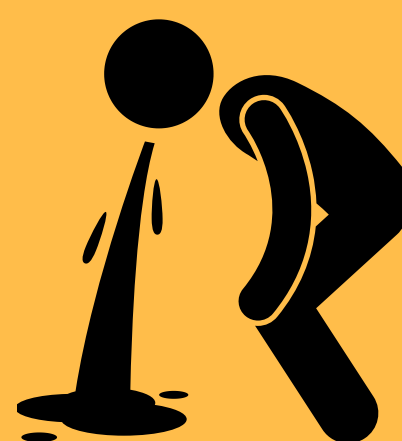
Vomiting or Diarrhoea