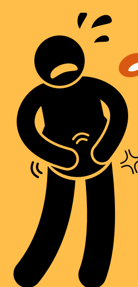
Pain or Extreme Discomfort