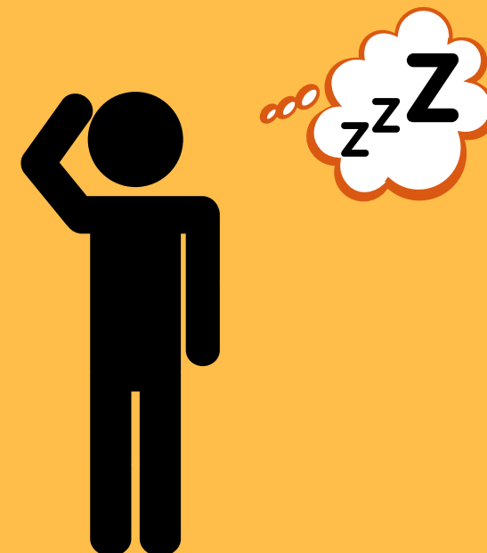
Sleepy or Confused